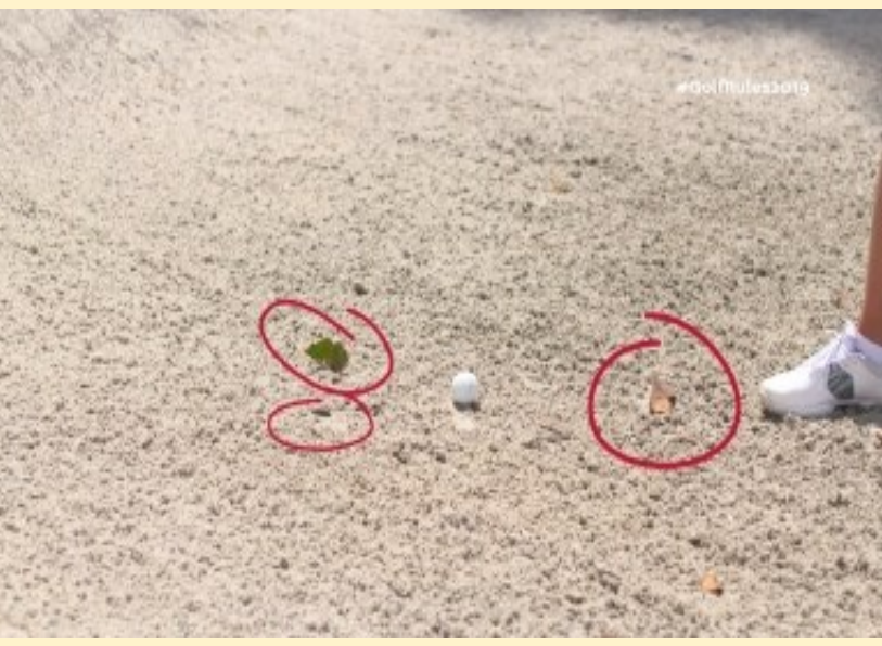
Each of these rules changes will take effect on January 1, 2019. Our hope is to make as many golfers knowledgeable of the upcoming rules changes before the new year. Good Luck & Play Well!